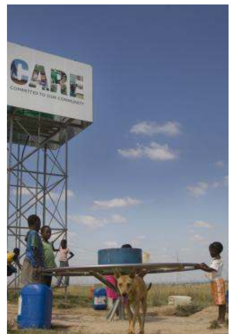
The roundabout Playpump, one of the innovative strategies that help communities to gain access to clean water.